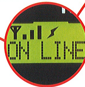
Backlit LCD user interface