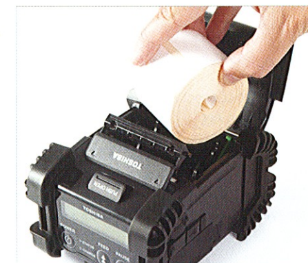
Market-leading media capacity for fewer roll changes