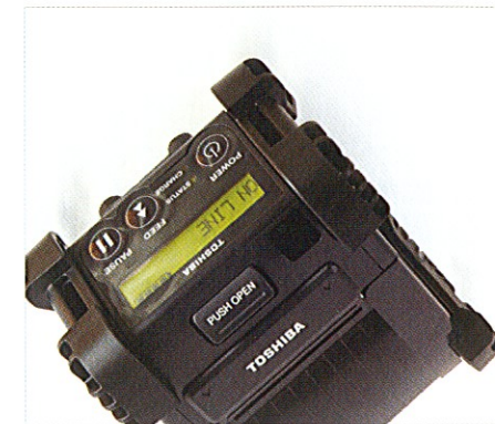
Robust and rugged, withstands a 1.8m drop on to concrete (1.5m for B-EP4)