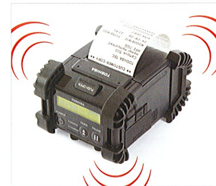
Wi-Fi certified (GH40 model)