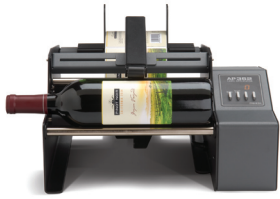
AP362 LABEL APPLICATOR