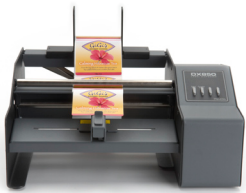
DX850 LABEL DISPENSER

are the perfect semi-automatic labeling solution for cylindrical containers as well as many tapered containers including bottles, cans, jars and tubes.